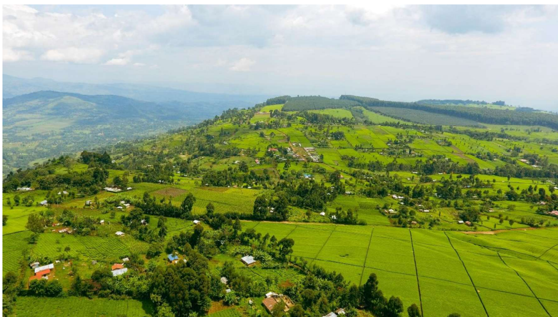
© Fairtrade / Nyokabi, Kenya coffee producers, Nandi Hills