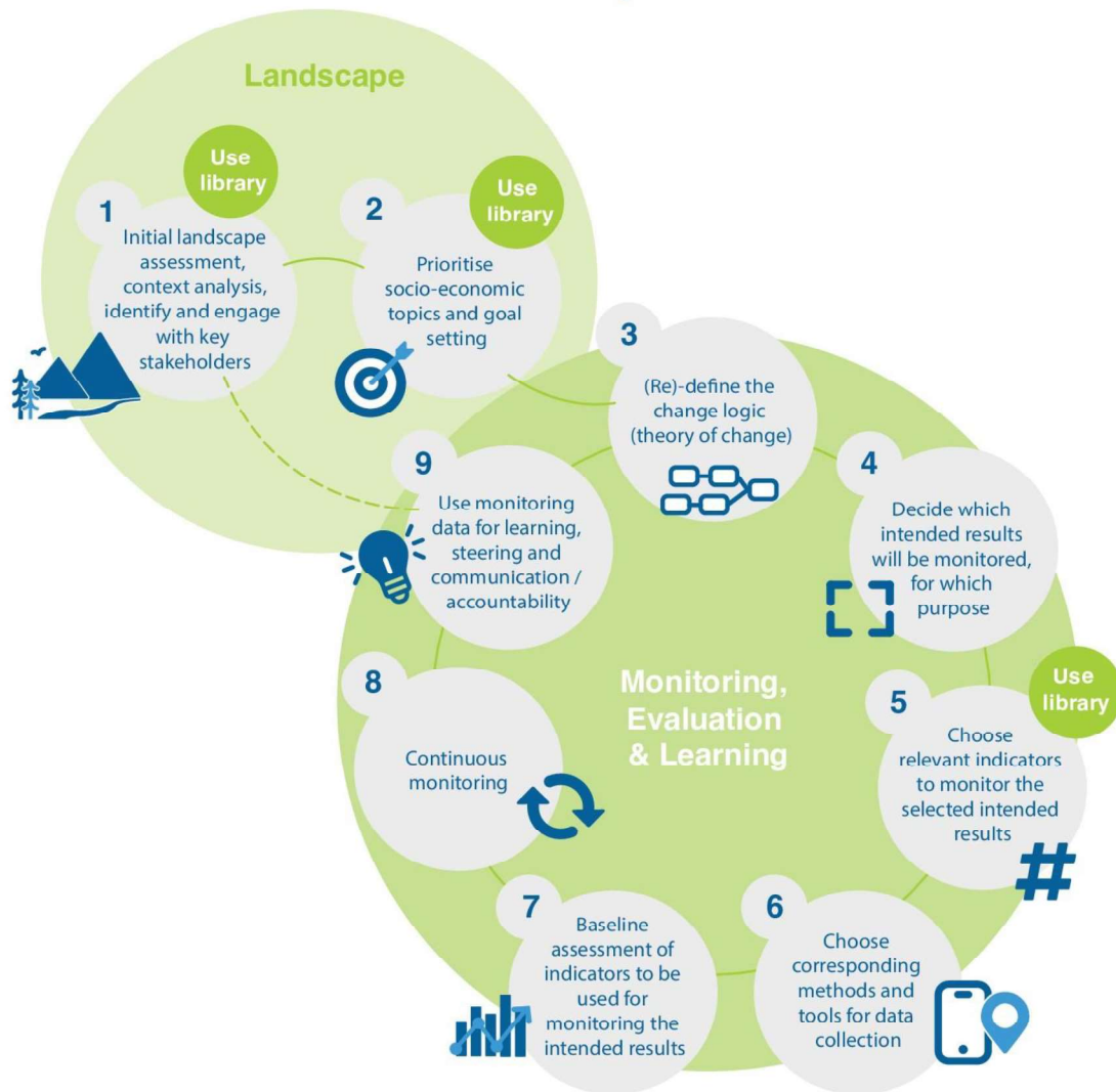
Figure 2: Visualization of the overall LMS process